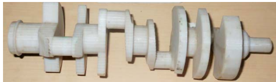
Powder bed based AM process; Temperature map in single-layer powder bed melting; Crank shaft made using FDM process (images from left to right)

AM processes can be categorized by the type of material used, the deposition technique or by the way the material is fused or solidified. Over the years, many AM processes have emerged with each of them having their own advantages and limitations.