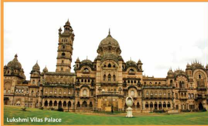
Lukshmi Vilas Palace

Vadodara derives its name from "Vatavruksha" meaning city of Banyan trees. It is also a city of gardens having historical Gaikwadi monuments. Vadodara is well connected by Road, Rail and Air. Vadodara is a major railway junction located on western railway connecting Ahmedabad, Mumbai, Kolkata, Chennai, Bangalore, and Delhi. Airport is also connected by various domestic flights from Delhi, Mumbai and via flights from most other cities.