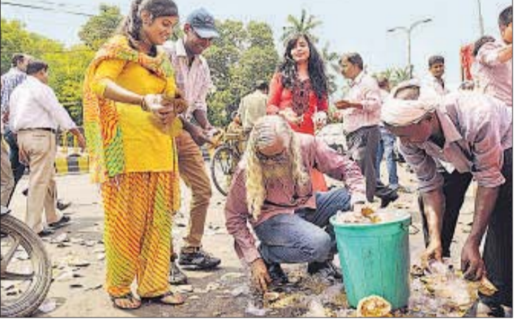
Locals cleaning up the area after a bhandara on Ashok Marg. However, littering was still visible at many places and people passed by without batting an eyelid.

BADA MANGAL MESS Several Lucknowites cleared the litter but many organisers failed to provide trash bins