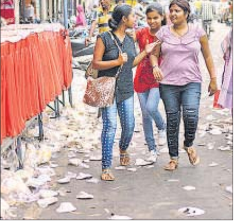
It was difficult to commute on the roads due to littering.