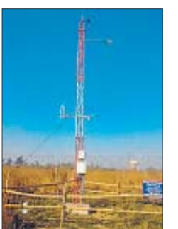
Monsoon prediction equipment at IIT Kanpur.

LUCKNOW: How about getting rain forecasts a few weeks or a month in advance? Early and accurate monsoon predictions may soon be reality. An experiment is underway jointly by India and the United Kingdom to improve the skill of rainfall prediction. The experiment is being carried out by several institutions, of which Indian Institute of Technology (IIT) Kanpur is also a partner.