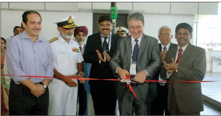
Inauguration of Exhibition