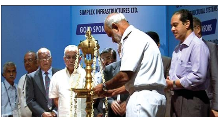
Lighting of Lamp