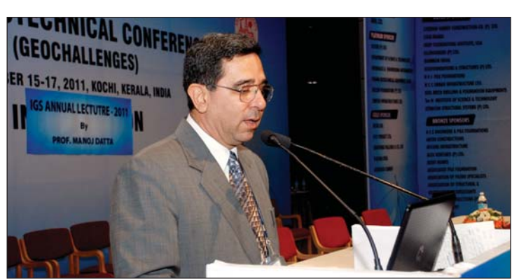
IGS Annual Lecture