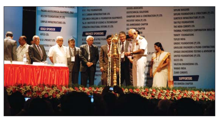
Lighting of Lamp