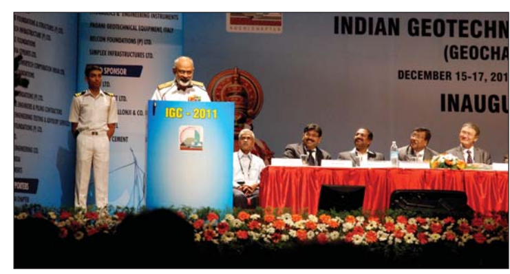
Address by the Chief Guest