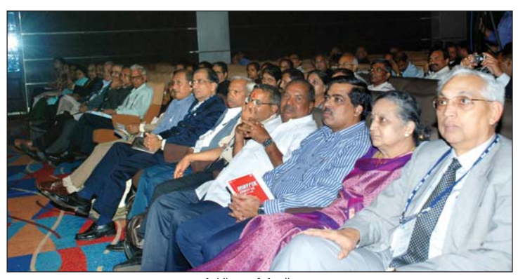
A View of Audience